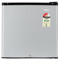
Haier 52 L 3 Star Direct Cool ... Price: Check on Amazon